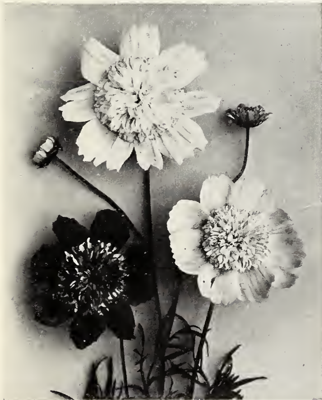
COSMOS, EXTRA EARLY DOUBLE CRESTED